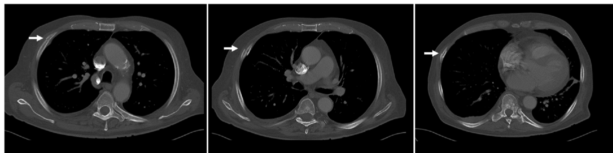
Figure 3 Same patient as in Figures 1 and 2. CT of the chest confirms the fractures of rib IV and V and reveals an additional fracture of rib VII.

The most common thoracic injury are rib fractures which can be found up to 67% of cases with blunt thorax trauma [9]. But rib fractures may also occur without an adequate thorax trauma. Typical risk groups are elder patients suffering from osteoporosis or patients with extreme sports activity such as rowing [10,11].