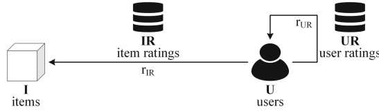
Fig. 3. Common feedback model of recommender and reputation systems.