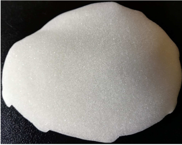
Figure 1: Model of a CAD/CAM non-resorbable biocompatible cranioplasty (Biomet, Germany) composed of polymethylmethacrylate (PMMA) spherical macro beads coated and fused with polyhydroxyethylmethacrylate (PMHA).

to remove the tumorous mass along the falx. Before surgery, computed tomography (CT) was carried out to visualize the bony attachments of the PMMA cranioplasty (Fig. 2C). Neither imaging modality had depicted any tumorous tissue inside the cranioplasty. Thus, preoperatively, the cranioplasty was not considered an area of tumor infiltration.