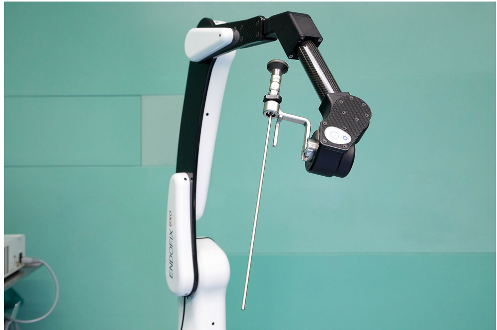
Fig. 1 The three electromagnetic locks of the ENDOFIXexo allow any position within arm range