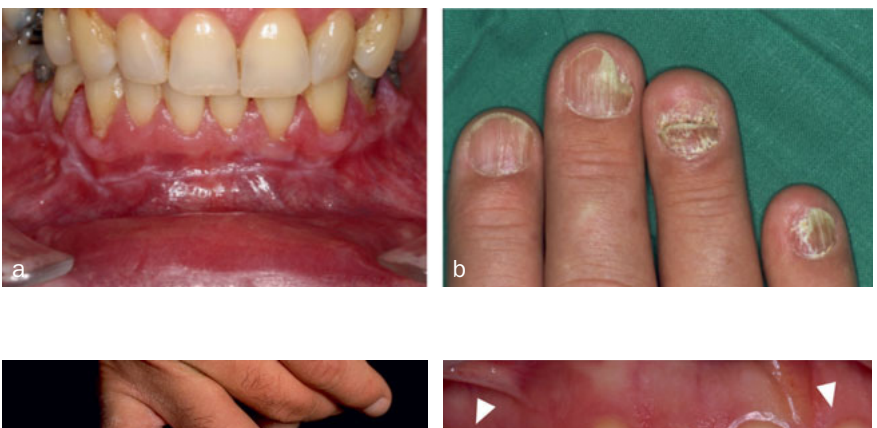
Fig 5 Oral lichen planus. (a) Oral lichen planus not associated with dental materials in the region of the entire mandibular vestibule. (b) Extraoral manifestation of lichen planus on the fingernails.