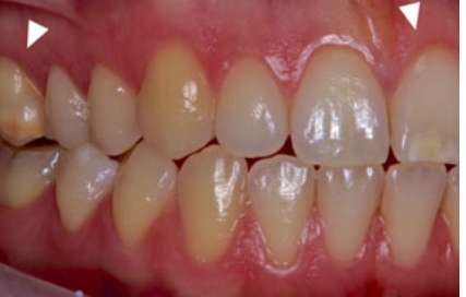
Fig 6 Contact allergy of a dentist to composite resins.<sup>21</sup>