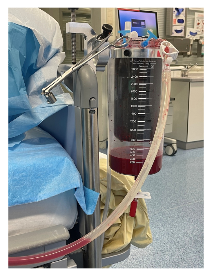
Figure 1. Cell saver reservoir at the bedside of an intensive care patient.