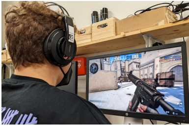
Figure 1: Depicts a participant playing Counter-Strike: Global Offensive in our study. Participants played with wired headphones and four levels of controlled auditory latency (0 ms, 40 ms, 270 ms and 500 ms).

obtain 1.5 credit points for their study course as compensation for participating.