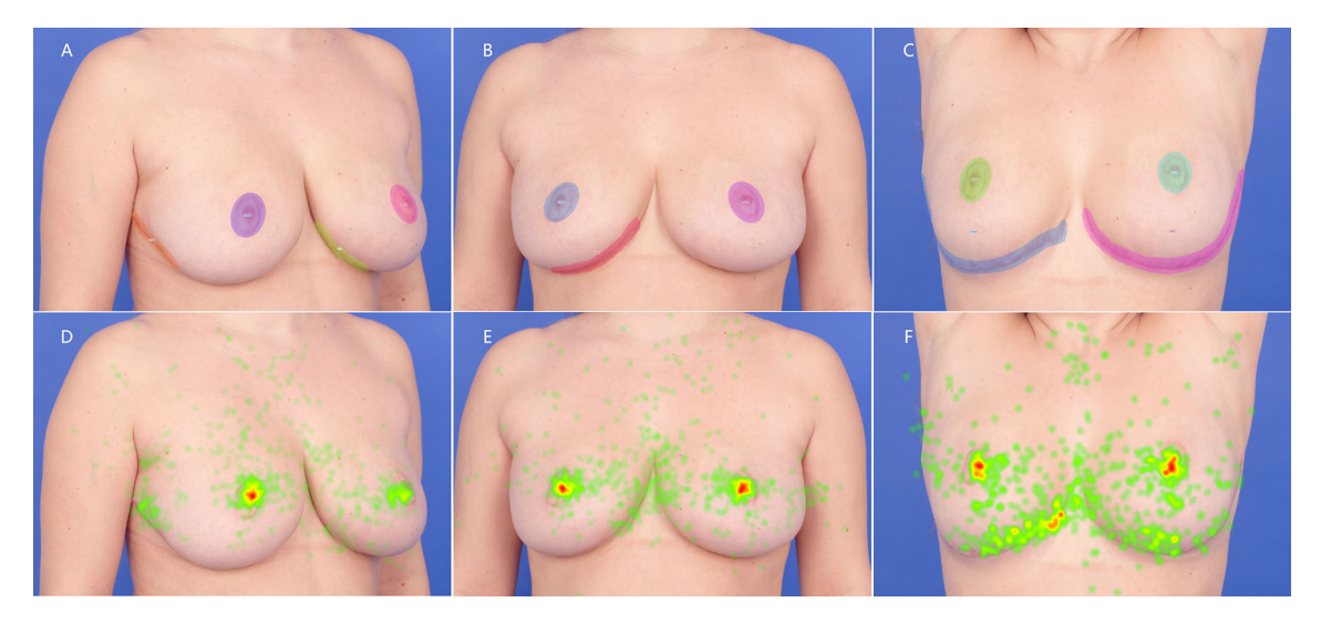
Fig. 3 Images of a patient undergone reduction mammoplasty in the no-vertical-scar technique, showing the breast AOIs (above) and heat maps (below) at right 45°oblique view (A and D), frontal view (B and E), and frontal view with arms raised (C and F). Ellipse: areola