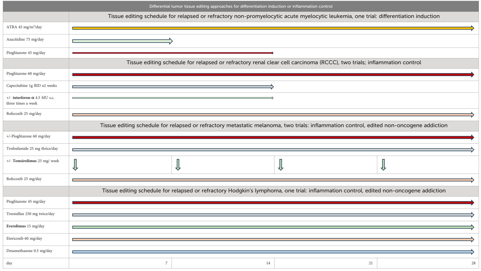
TABLE 2 Editing schedules for differentiation induction in relapsed/refractory (r/r) acute myelocytic leukemia and inflammation control in r/r renal clear cell carcinoma, r/r Hodgkin's lymphoma and r/r metastatic melanoma are exemplarily shown.

In Hodgkin's lymphoma and uveal melanoma, editing of non-oncogene addiction is possible.